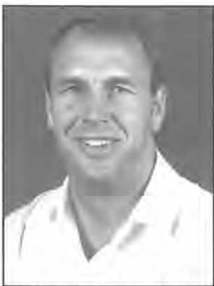
MIKE MULARKEY Tight Ends Coach